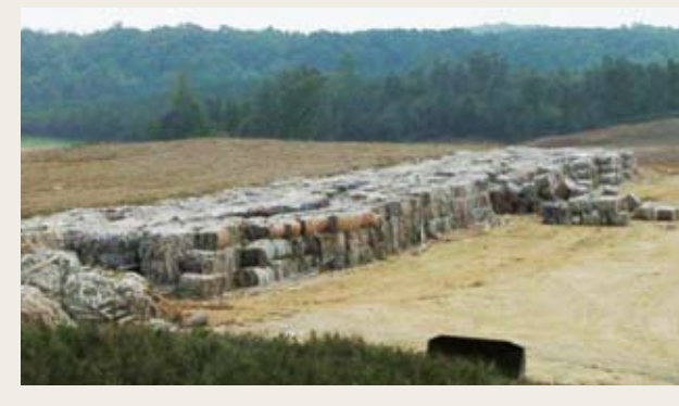
Segregated monofills can store material, like carpet, so that if it becomes viable in the future, we can more easily "mine" these landfills.

Their research team is extending its work to address new operational control and infrastructure design problems associated with the uncertainty and variability in closed loop supply chain flows on a global scale as products evolve through their life cycles. Working with companies and government organizations, their objective is to facilitate recycling and reuse and eliminate product disposal in landfills (some of which is hazardous waste, like CRTs).