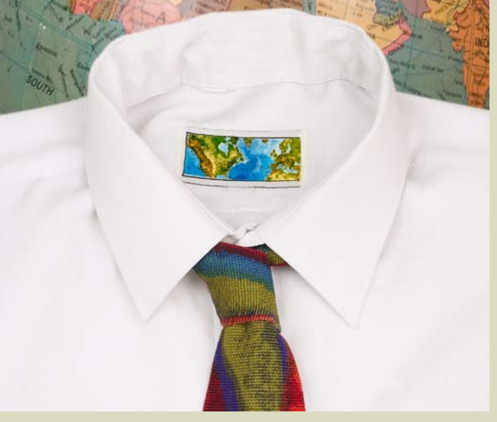
You might be surprised to learn the number of countries involved in making this shirt.

"Almost all the remaining forest [in Sumatra and Borneo] is at risk. Even the Tanjung Puting National Park in Kalimantan is being opened up by oil planters. The orangutan is likely to become extinct in the wild. Sumatran rhinos, tigers, gibbons, tapirs, proboscis monkeys and many other species could go the same way. Thousands of indigenous people have been evicted from their lands, and some 500 Indonesians have been tortured when they tried to resist. The entire region is being turned into a vegetable oil field." <sup>5</sup> Clearly, in a civilized society, the threat of extinctions and food insecurity as antidotes to the eventual depletion of fossil fuels can no longer be ignored as mere externalities.